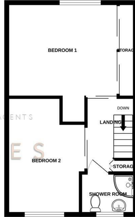
1ST FLOOR 398 sq.ft. (36.9 sq.m.) approx.